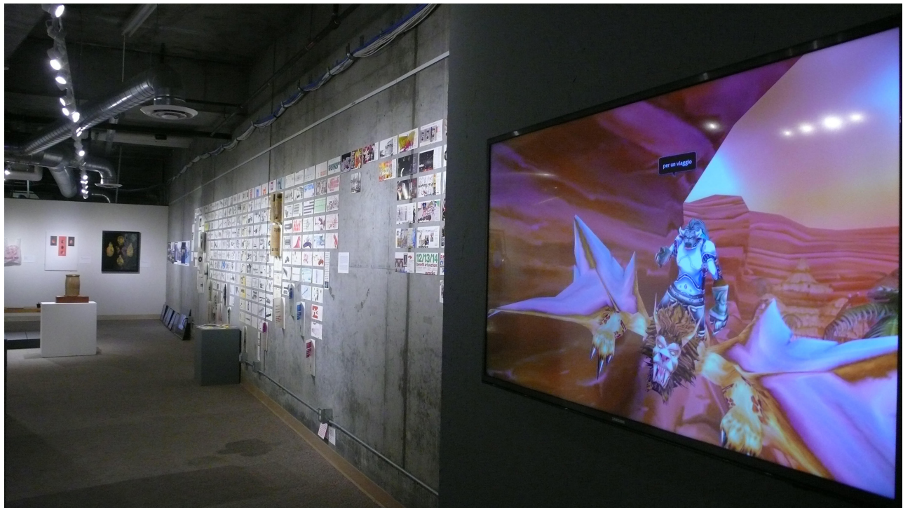
Figure 1: Installation View Arido Taurajo, Leaving Orgrimmar , 40th anniversary exhibition “Making It Works” Works Gallery San Jose, image: Joe Miller