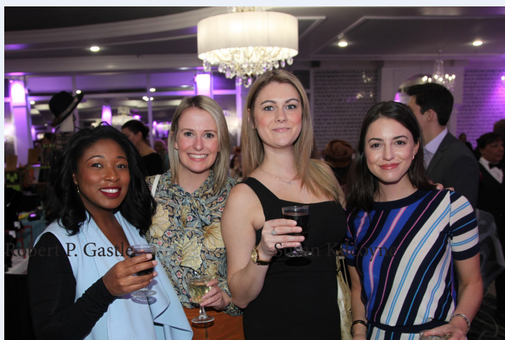
C&FS supporters at the 2019 Fashion Show with a Twist.