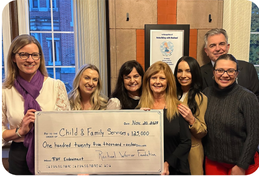
Child and Family Services unveiled a plaque dedicated to the Rachael Warrior Foundation in recognition of their $125,000 gift for Haven House on Monday, November 20, 2023.