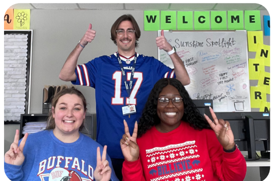
The Agency showcased their 716 spirit on Friday, January 19, 2023. Our foster care team dressed in Buffalo Bills attire.