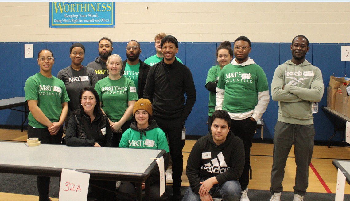
Volunteers from M&T Bank participated in Adopt-a-Family.