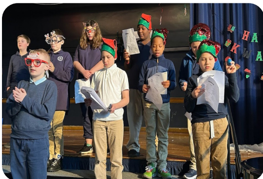
Students at the Stanley G. Falk School put on a musical performance during the holiday season.