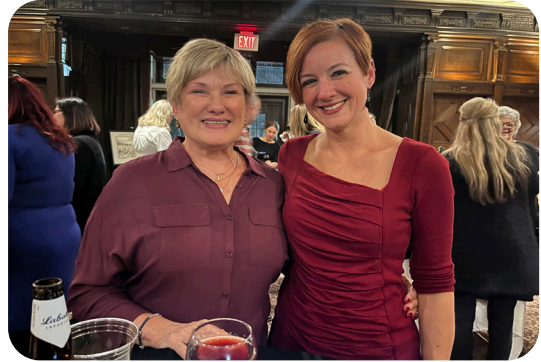
Donors and partners were invited to attend Partner Appreciation Night at the Richmond-Lockwood Mansion for an evening of wine and crudites on Thursday, December 5, 2023.