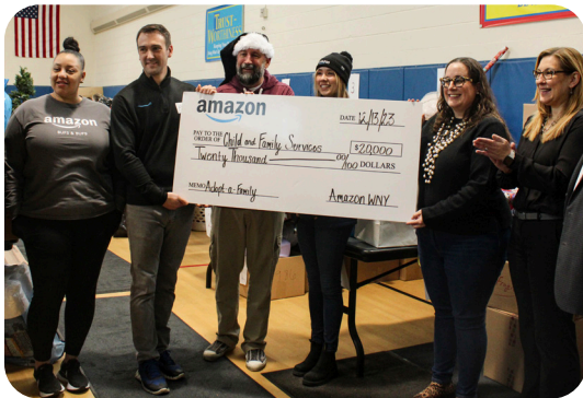
Amazon presented Child and Family Services with a $20,000 check for Adopt-a-Family on December 13, 2023.