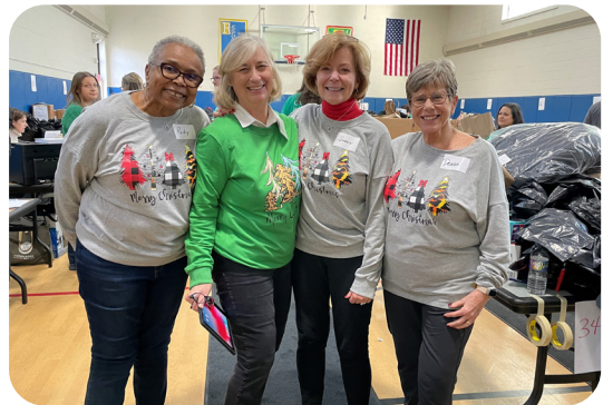
Volunteers helped greet donors, organize and sort through donations and spread holiday cheer during Adopt-a-Family.