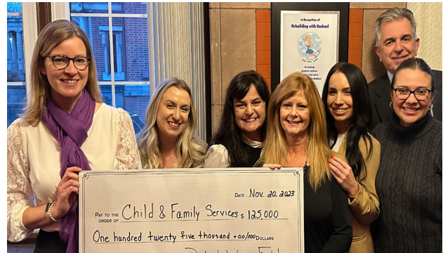
The Rachael Warrior Foundation, Inc. presented C+FS with a $125,000 check.