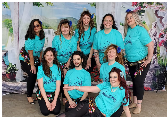
Hayatidance Studio hosted a fundraiser for Haven House.