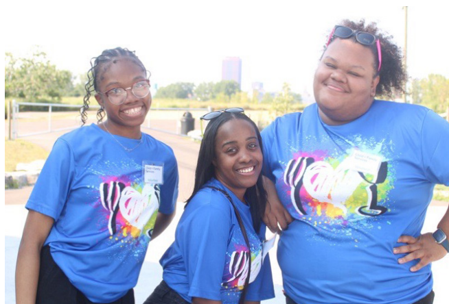
Wegmans employees at Heartlight at the Harbor 2024.