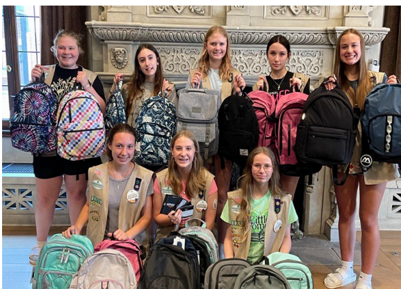
Girl Scout Troop 30173 donated empowerment packs to Haven House.