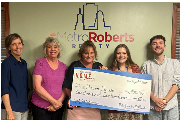
WNY MetroRoberts Realty's HOME committee gave $1,400 to Haven House.