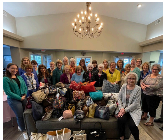
Delta Kappa Gamma Society, Alpha Lambda Chapter organized a purse donation with essentials for Haven House.