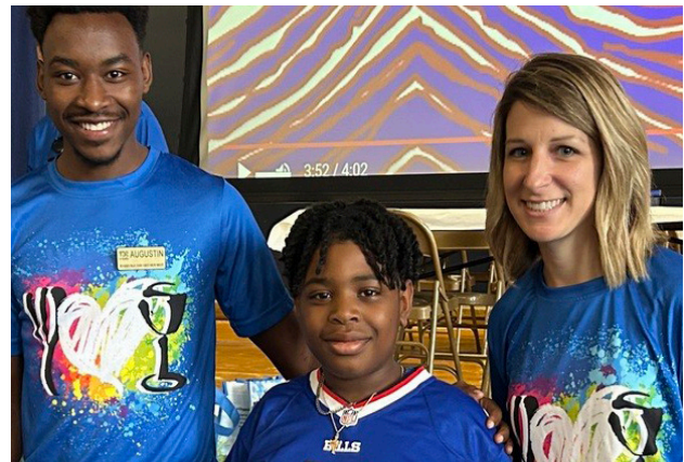
Wegmans employees volunteered at the Stanley G. Falk School on 716 Day.