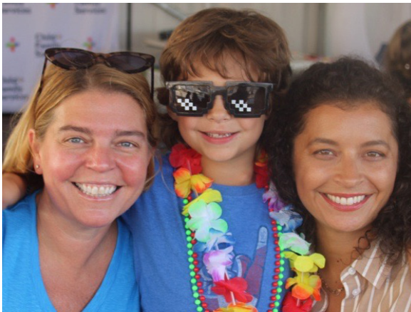
Hodgson Russ LLP at Heartlight at the Harbor 2024.