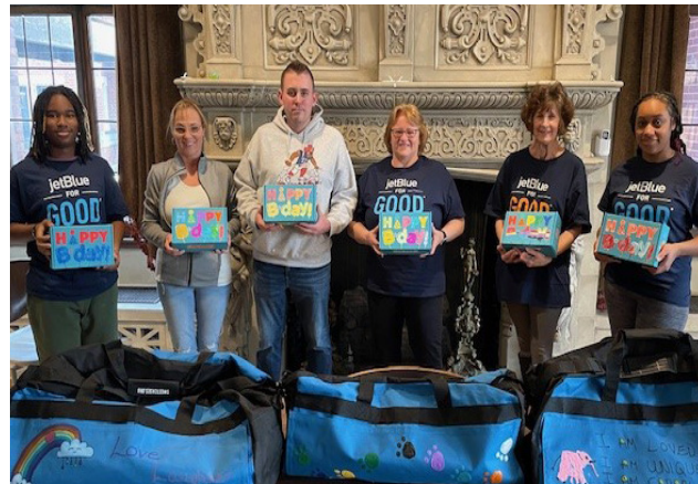
JetBlue assembled birthday boxes and "Sweet Cases" for children.