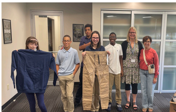
Little Smiles, a volunteer-driven children's charity donated uniforms to the Stanley G. Falk School.