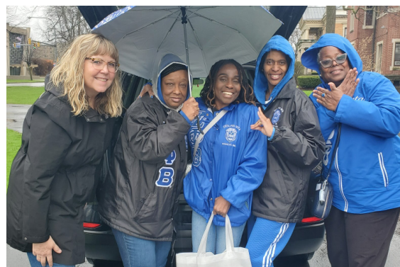
Zeta Phi Beta Sorority, Inc. Kappa Upsilon Zeta Chapter.