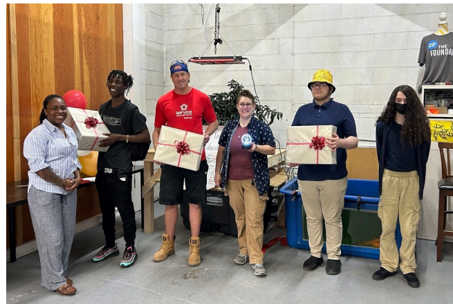
Stanley G. Falk high school students partnered with The Foundry to create night lights for Beds for Buffalo and garden trellises for Grassroots Gardens.