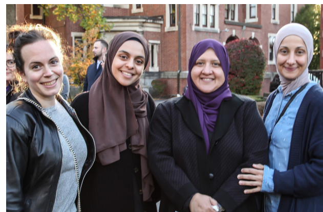
Shine the Light 2023 press conference.