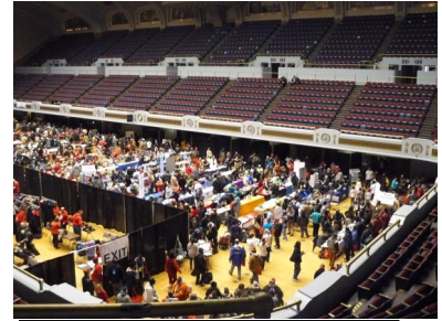
2016 Homeless Stand Down

Northeast Ohio Coalition for the Homeless 3631 Perkins Ave. 3A-3 Cleveland, Ohio 44114 216/432-0540 neoch@neoch.org