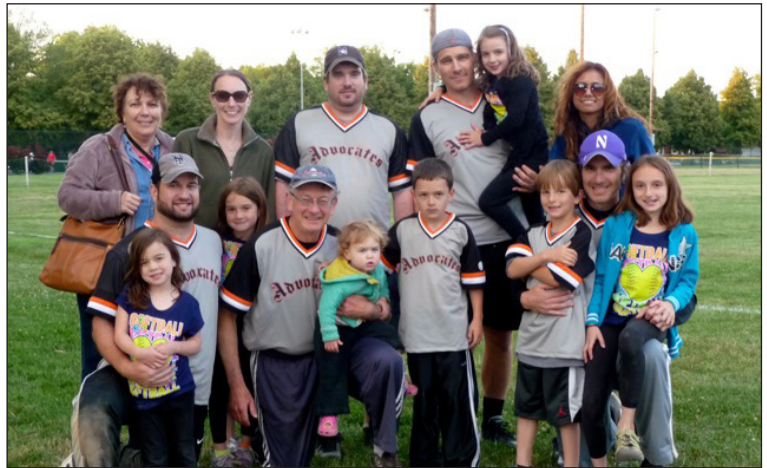
The Denlow Family Team.

Chief Judge Holderman lauds Judge Denlow for recognizing that the purpose of litigation is to resolve disputes, and that there are superior ways to resolve a case other than by trial. In settlement, parties can be creative and obtain many benefits not available