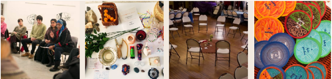
From left to right: a restorative justice circle, tools of circle keeping, a circle awaits, element prompts.

We continue to seek ways to connect with people, to share the power and potential of restorative justice and welcome suggestions regarding outreach and communications!