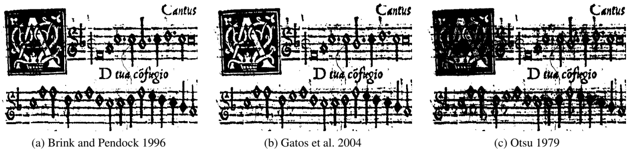
Figure 2. Binarisation output from three algorithms on RISM 1538-5.