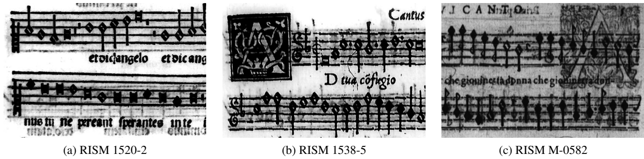
Figure 1. Three sample images from the test set.