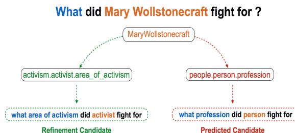
Figure 1: Sketch of our approach. Elements in solid round rectangles are KB relation labels. Relation on the left is correct, but the base QA system predicts the one on the right. Dotted rectangles represent revised questions with relation labels plugged in. The left revised question looks semantically closer to the original question and itself is more consistent. Hence, it shall be ranked higher than the right one.