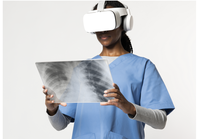
Figure 1: Using VR for XRay Diagnostics.

Recently, Sousa et al. [22, 32] showed that the application of Virtual Reality (VR) technologies for radiology reading rooms constitutes a viable, flexible, portable, and cost-effective option to address