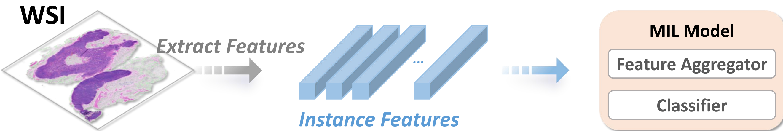
(b) Conventional Multiple Instance Learning Paradigm