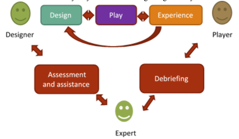
Fig. 1. Multilayer Framework

Multi-layer methodology (see-Fig.1) provides an evaluation support to design serious games, it focus on a collaborative framework to engage concerned experts, designers and players to promote reflection and efficiency analysis of serious games design [3]. They follow the reflection on design, play, and experience concepts [4] to analyze a serious game; the actor comes up with the goals for the resulting experience to guide the design, defining the context that arises when the player uses the game, and specifying mechanics to measure the effectiveness of the design once implemented. The assessment and debriefing layers provides an effective visibility and assistance for the expert actor during the achievement of the serious game. He can proceed in a more formative and summary way to make serious game genuinely beneficial.