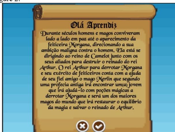
Fig. 2. Screen explaining the story behind the game.

The game FracPotion is a simple adaptation of the classic history of King Arthur and his knights, where to defeat the villain Morgana, the player (as an apprentice) will have to hit the right amount of ingredients to complete the potion represented by fractions. This kernel of the game is explained (in Portuguese) on screen of game illustrated in Figure 2.