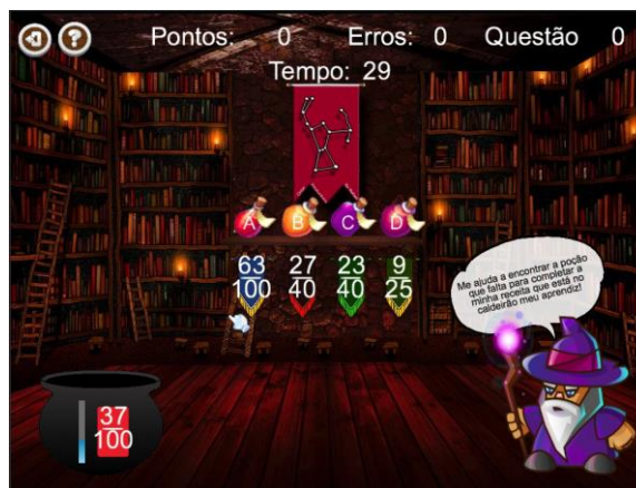
Fig. 3. First level of the game

It must be noted that, even though the game was conceived in Portuguese language, it can be easily translated to any other language, as well as it is possible to modify most of its aspects, given that it was designed as an Open Educational Resource. Source code is available on GitHub and is made available under open source license.