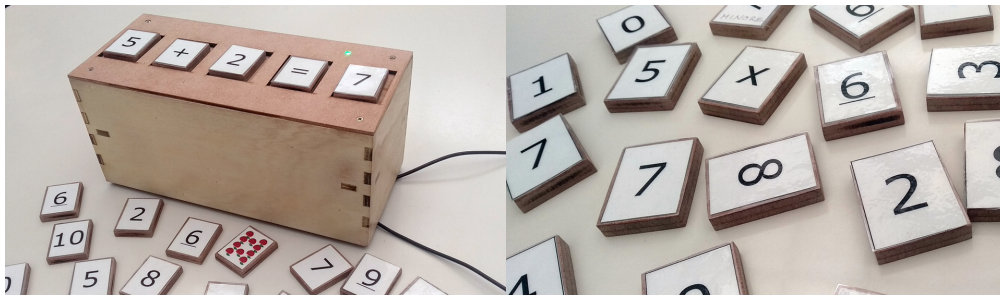
Figure 2: On the left SMARTER, on the right a set of tiles.