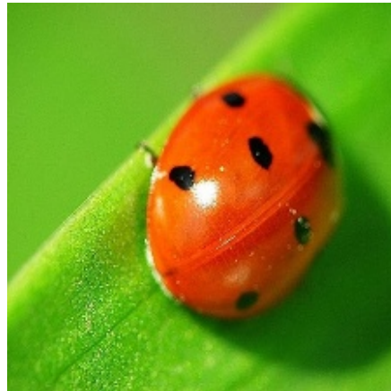
Figure 2: Image of a ladybug from the Mini Imagenet dataset

In U3DAL, the measurement of uncertainty is entropy, which is a well-established measure in the active learning domain. Predictive entropy is a measure of the spread of the probability distribution over all the possible classes. High entropy indicates increased randomness, which means that the model is unsure about the true class, whereas low entropy indicates that the model is confident in its prediction, regardless of its accuracy. High entropy data points are usually close to the decision boundary and therefore can be categorized as the known unknowns of the model. Identifying these data points which are close to the boundary and labelling them selectively results in an improved performance without the need to label all instances.