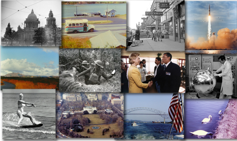
Fig. 1. Some example images from the Date Estimation in the Wild dataset.

regression problem, respectively. Experimental results show the feasibility of the suggested approaches which are superior to annotations of untrained humans.