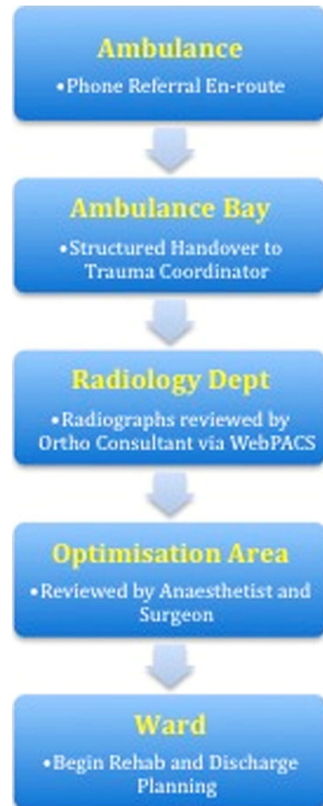
Fig. 1 Redesigned pathway

Two particular areas of concern were raised and specific plans were made. Following discussion with the haematology department, a protocol for the management of anticoagulated patients was created (Fig. 2). This uses a prothrombin complex concentrate to reverse the effects of warfarin and allow immediate, safe surgery (when theatre space is available). Secondly, situations where the patient is unable to give consent were discussed. It was decided