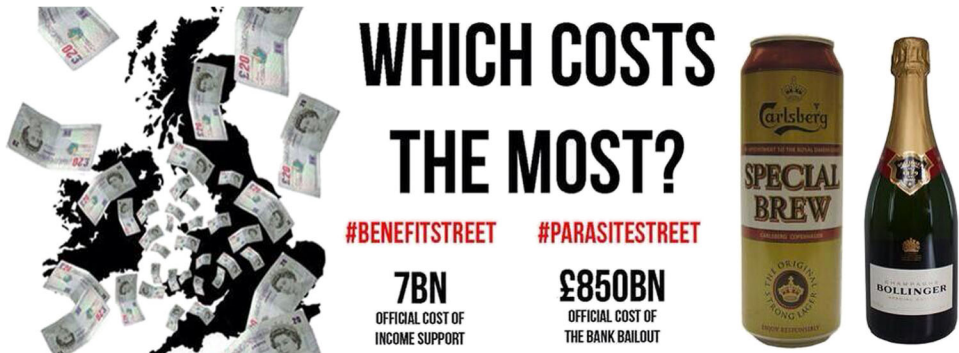
Figure 2. The London Economic's infographic based on Parasite Street discourse.

parasite we need to feed #ParasiteStreet" [P1282, 17.01.14, Twitter]. This tweet is an example of frame bridging (Snow and Benford 1988); the process of linking two separate, but congruent, discourses together. The tweet takes the literal connotation of the term parasite – a relationship where one gains at the expense of another – and applies it to the (then) UK Prime Minister. This was echoed in other tweets: "MPs waste lots of public money commissioning portraits! <url> #parasitestreet" [P1015, 17.01.14, Twitter] and "This MP, voted against this parliament bill, and now receives $100ks from oil companies" [P1095, 20.01.14, Twitter]. In these examples, two discourses are drawn together; the discourse established by Parasite Street that the rich are exploiting and taking money from the state, and the discourse established by the UK Parliamentary Expenses scandal of 2009, where some members of parliament (MPs) were exposed for claiming excessive – or even illegitimate – expenses.