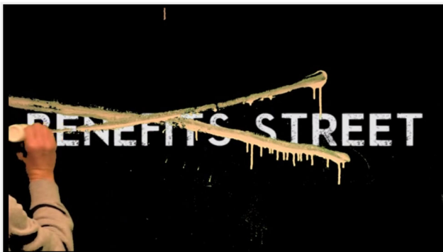
Figure 3. Screen capture from The Great British Take-Off. © Positively Stockton-on-Tees, 2014

“there’s lots of little local sites [pages] like Norton News and Stockton Incidents. It doesn’t take long for people to say ‘It’s happening!’ and then myths begin before realities.” [Interview, MM]