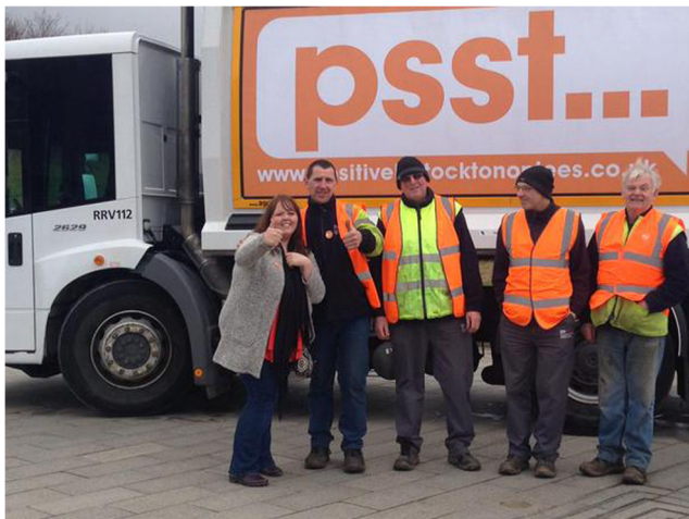
Figure 4. PSOT branded refuse vehicle.

As noted, Instagram was primarily used for replicating content from the Facebook page, where the image shared would be identical to that used on Facebook and accompanied by a comment that would simply re-direct users back towards the