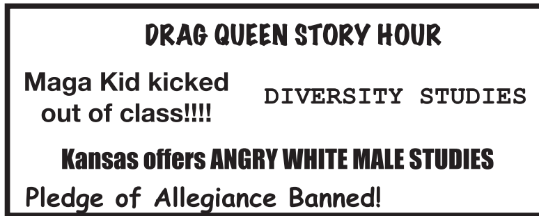
Figure 2. Headlines like these are common in right-wing news.

One frequently circulating story is one where a student is kicked out of class for supporting trump or wearing a trump hat. One example reads: “High school student wears MAGA hat, gets berated by leftist teacher and told he’s not entitled to learn, then evacuates class!” 1 This circulation of headlines like these creates an idea of leftist educational hegemony. They construct the right as a marginalized group, and the liberals who criticize them as the bigots and oppressors.