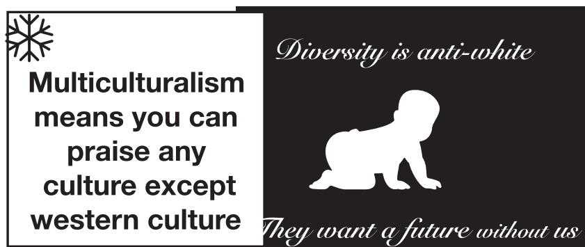
Figure 3. Memes similar to these frequently compare diversity to an attack on whites.

Alt-Right. Users reposted a tweet and commented below to extend and shape its interpretation in a new dictionary of White nationalist hate. The initial post asserts that multiculturalism is opposed to western culture, both that the so-called western culture is not included in multiculturalism and that this same imagined western culture is uniquely responsible and blame-worthy. This goes beyond White fragility (DiAngelo, 2011) to a White identity politics, a full-throated defense of privileges in response to a perceived status threat (Jardina, 2019; Mutz, 2018). They assert multiculturalism is a threat to White identity. Continuing this, and essentially unpacking the dog whistle of the original tweet; a user states western culture = White people, and another user states Diversity = no Whites. Regardless of their seriousness here, these definitions are consistent across Alt-Right media. This reframes calls for inclusive, responsive, humanizing education as a hegemonic, anti-White agenda. This isn't simply conservatives alienated by liberal schools, but the use of the language of oppression, diversity, and culture to preserve White dominance.