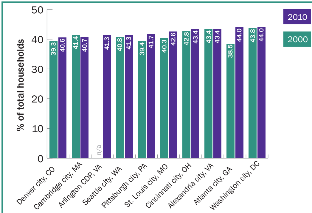
Figure 2: Top ten cities of 100,000+ population with the highest percentage of one-person households: 2000 and 2010