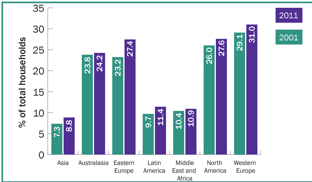
Figure 3: Proportion of single-person households by region: 2001 and 2011