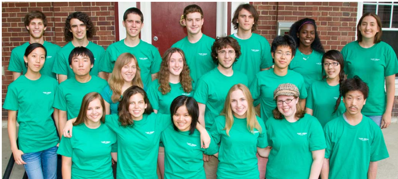
2008 TASP at the University of Michigan