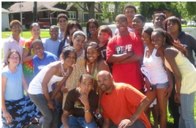
2008 Indiana TASS