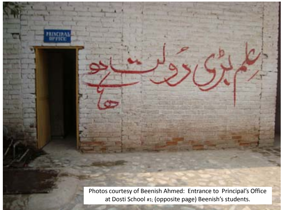
Entrance to Principal's Office at Dosti School #1; (opposite page) Beenish's students.

To compare my experience at Dosti with other schools, I toured schools of various types, both private and public. In doing so, I found that functional illiteracy was a problem not only in schools for children living in poverty, but across the board. By working one-on-one with teachers and principals in a handful of schools, I was able to eventually give speeches at some of Peshawar's high-end private schools to make a case for service work as a compliment to education in the way that it exists in many high schools in the States. I met with principals and teachers in an effort to create inter-school tutoring exchanges. While they were often receptive to the idea, none felt it was something they were in a position to inaugurate. They told me that parents spent money to send kids to the best schools and would take their kids out the second they knew that the school expected them to work in such low stations. Such striking divisions of labor block interac-