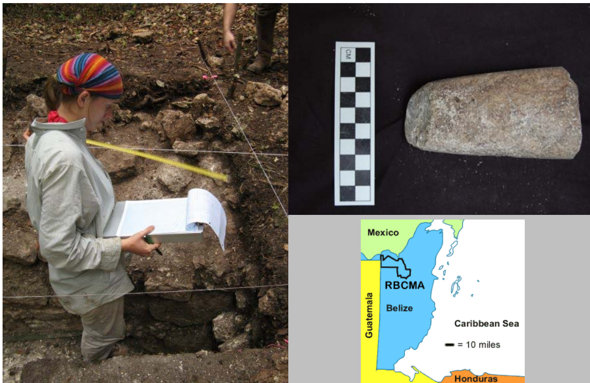
(left) author at the excavation site; (upper right) Tool: “Mano”; (lower right) Map: Excavation Site.