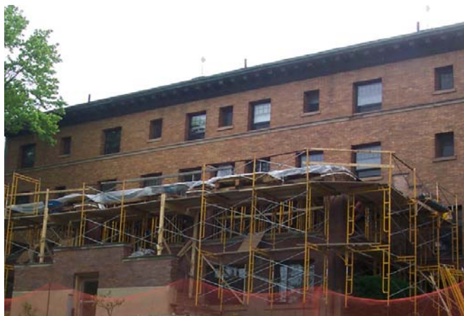
Photos: Deconstruction of porch balcony, June 2008, and bricks in waiting, saved and sorted for reuse.

The 2008 Cornell TASPers will remember this as the summer the front balcony was replaced; many other Telluriders may not notice, unless they look carefully. Mason W.L. Kline & Co. of Binghamton tore the structure down to the tops of its supporting pillars, saving the existing brick, stone, and copper work, and rebuilt it to plans drawn up by consultants Taitem Engineering and Vicky Romanoff of Ithaca. The old balcony's structural steel frame had rusted out due to a leaking roof membrane on the balcony's top surface, and Taitem estimated that it could only be used safely for another two years at the most. With proper care, the new balcony should last for CBTA's next 100