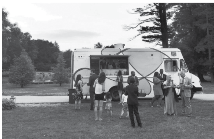
Mei Mei food truck.

Historically, farmed fish have been fed a diet consisting primarily of fishmeal and fish oil derived from wild-caught fish. This means that aquaculture as currently practiced in much of the world does not actually reduce pressure on wild fish stocks. My research is about developing low-fishmeal diets for farmed fish. I'm currently working on a project to use insects raised on dairy waste as an alternative to fishmeal and fish oil. From the industry perspective, this is seen as a way to reduce costs, but to my mind it aligns perfectly with environmental/ecological priorities. The challenge at this point is mainly nutritional: creating healthy and balanced diets from new ingredients.