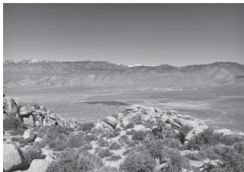
Deep Springs Ranch

These are parlous times. The mind and heart of every patriotic American are being stirred as they have not been for a generation. We are undergoing an awakening, a rebirth, of our national consciousness, and perhaps, in no long time, our rejuvenation will be consecrated in a baptism of fire, from which we shall emerge a nation of peoples refined and ennobled in the crucible of war.