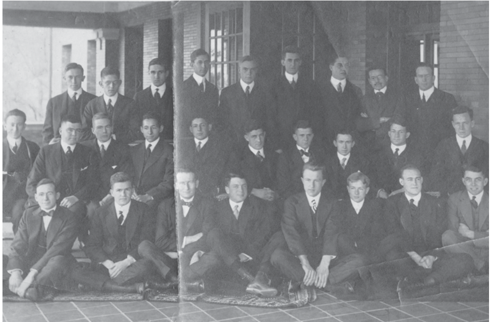
Cornell Branch 1917