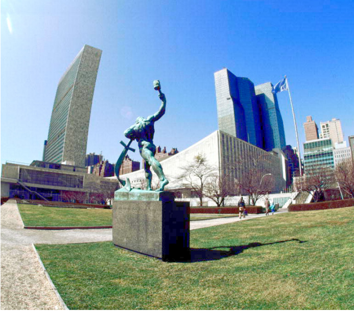
Sculpture "Let Us Beat Swords into Ploughshares" at NY Headquarters

The flags of the 193 United Nations Member States provide a colourful, 500-foot wide curved approach to the Headquarters, along United Nations Plaza. The circular pool in front of the Secretariat Building, with a fountain in its centre, was built with a $50,000 gift from the children of the United States. The wavy pattern on the floor of the pool is formed by alternating bands of crushed white marble and black pebbles. The black stones were gathered from the beaches of Rhodes by the women and children of that Greek island and donated to the United Nations. A bronze sculpture in memory of the late Secretary-General, Dag Hammarskjöld, was set at the edge of the pool in 1964. The abstract sculpture, entitled "Single Form", is the work of the English modernist sculptor and artist, Barbara Hepworth, and was donated by Jacob Blaustein, a former United States delegate to the United Nations.