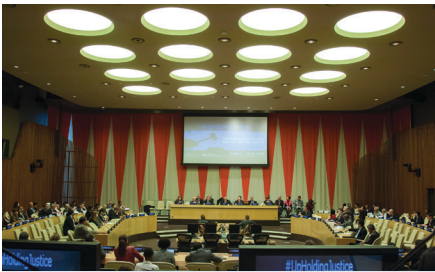
ECONOMIC & SOCIAL COUNCIL