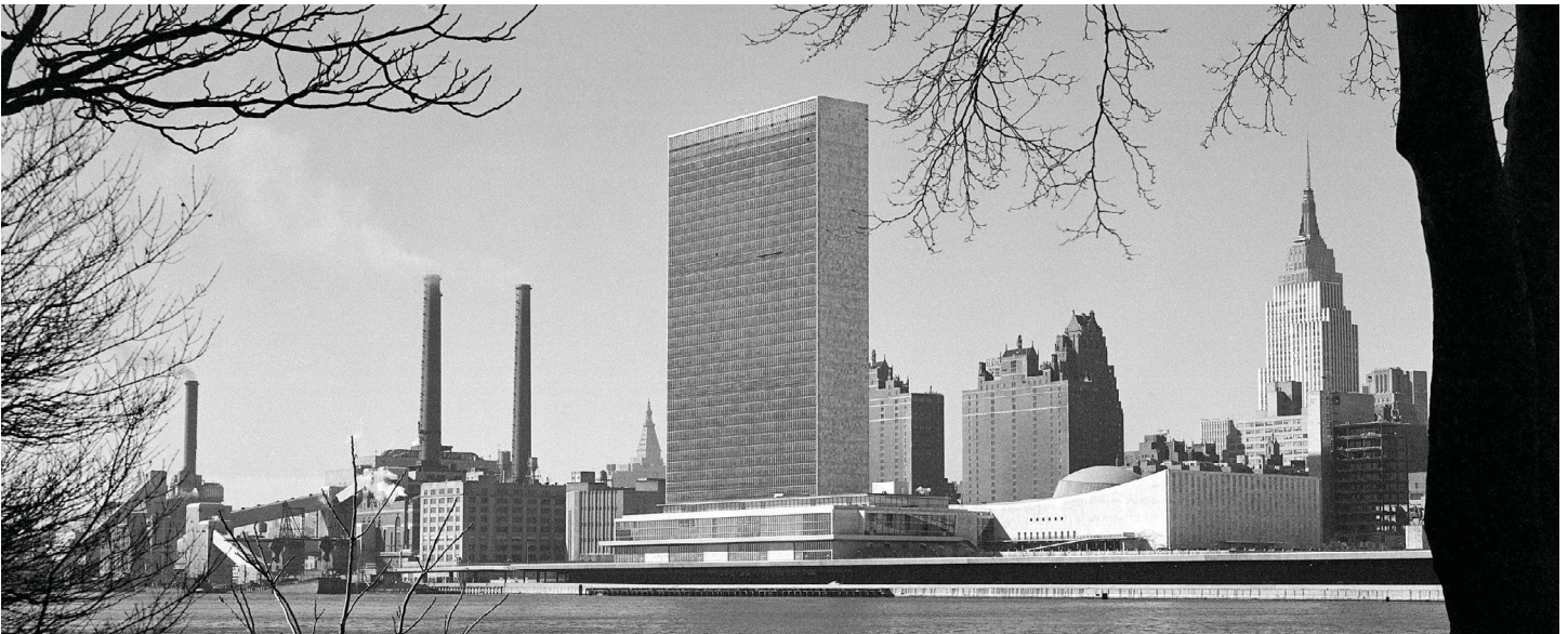
United Nations Headquarters, 1960

ADDRESS: United Nations, New York, NY 10017, USA