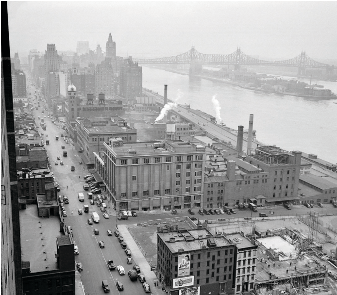
New York, 1946

Standing on the eastern shore of Manhattan Island, on the banks of New York City's East River, the 18-acre United Nations Headquarters remains both a symbol of peace and a beacon of hope.