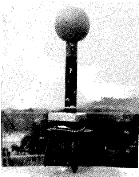
Fig.1 The ball target

The original shape of the structure gradually deforms or distorts in time as a result of the structure corrosion, load, intermittent cross winds and similarly, as is the case of pipe line suspended cable bridges in Priestany, Nelahozeves and in the Winter port in Bratislava.