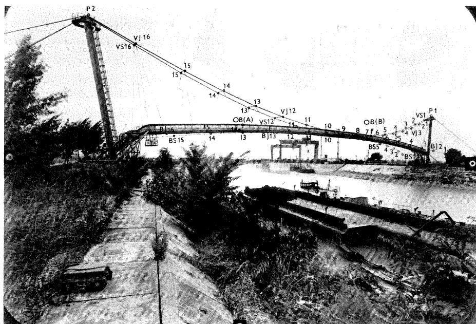
Fig.2 The numbering system of the structures detail points.

During the measurements of the given bridges the wide-angle universal camera UMK 10A Zeiss Jena proved to be the optimum camera type, whereby it was in all cases possible to take photographs with a horizontal camera axis. The photogrammetry accuracy is a function of the photograph scale, and therefore we try to choose the photogrammetric base lines as near to the measured structure as possible. However, the decisive factor is the required accuracy, in the given case less than 30mm.