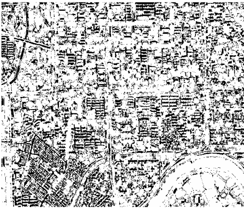
Fig.5 Dark objects sensible to structure element N_1