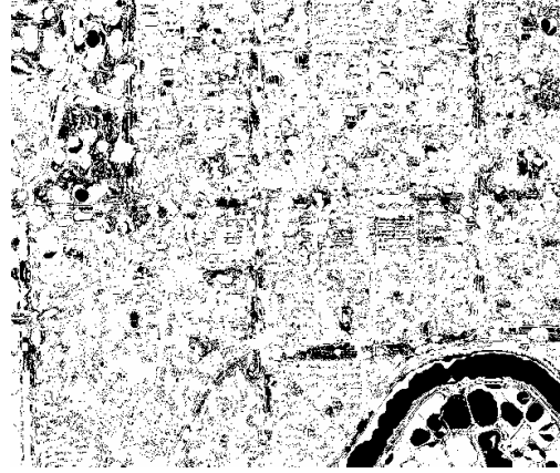
Fig.4 Objects insensitive to the structure element sequence