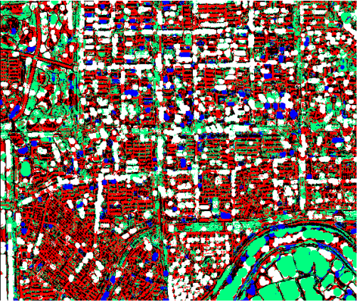
Fig.7 Result obtained by the proposed method in this paper