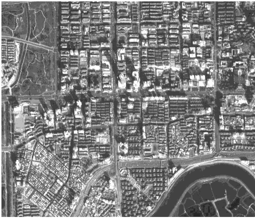
Fig.1 IKONOS image in Shenzhen, China

segmentation (figures 2-6), and the black part includes pixels with same morphological features. Figs. 2 and 3 show the peaks with different features. In Fig.2, the light objects smaller than N_1 mainly consist of buildings, while the light objects greater than N_1 but smaller than N_2 appear in Fig.3. Some pixels belonging to plains, which have a lower response to the structure elements in a given size, can be found in Fig.4. The objects included in Fig.4 are related to the selection of threshold value \sigma , a greater \sigma means more objects will fall into this image. As rivers and ponds are homogeneous in a large area that are bigger than the structure elements in given sizes, they have a lower response to the structure elements. In general, if the size of the given structure element is great enough (larger than these objects), the objects will belong to valley images because these objects are very dark (local minimum) in the image. Figs. 5 & 6 consist of valleys with different morphological features. Some small and dark objects are mainly included in Fig.5, such as grass plots and shadows between buildings and some streets within residential areas. Grass land and greenbelts located on both sides of roads in bigger areas are shown in Fig. 6.