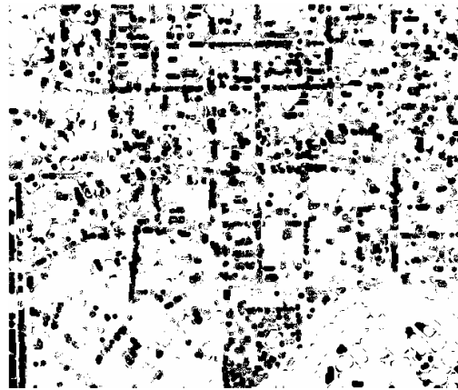
Fig.6 Dark objects sensible to structure element N_2