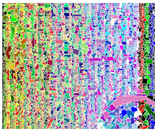
Fig.8 Result obtained by the watershed segmentation

The results of multi-scale segmentation to remotely sensed image are shown in Fig. 7. In this resultant image, the buildings, water, grassland and roads can be basically distinguished. Fig. 8 is the result of watershed segmentation, which is calculated by Matlab. It can be seen that over segmentation and boundary pixels spoiled the results. Compared with Fig. 8, the segmentation approach proposed in this paper is better than